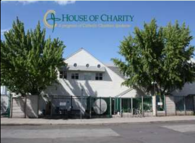
House of Charity 32 West Pacific Ave **** Spokane, WA

I would like our chapter to donate to the House of Charity this year. You can